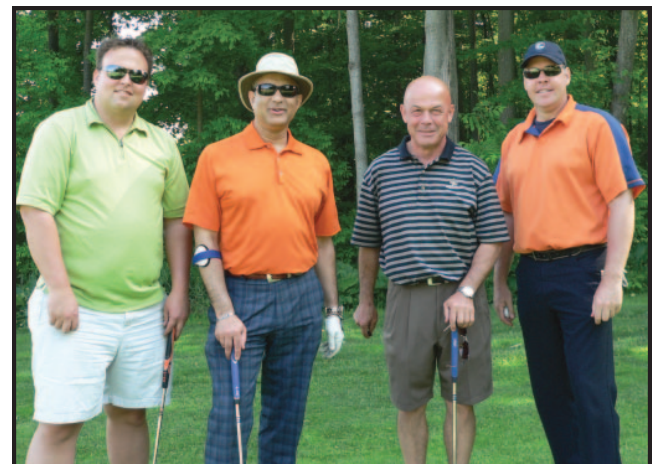
Foursome from CIBC Wood Gundy - Oakville.

Our next tournament is Thursday, June 3rd, 2010. See you there!